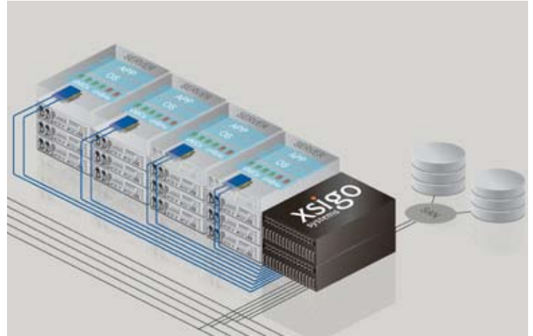
With Xsigo: Server and storage connectivity is consolidated to enable flexible allocation of resources, across the data center

“...External I/O virtualization can allow I/O resources to be pooled, expanded and assigned to individual servers or virtual instances in a more granular and dynamic fashion than traditional hardwired interfaces. ..”